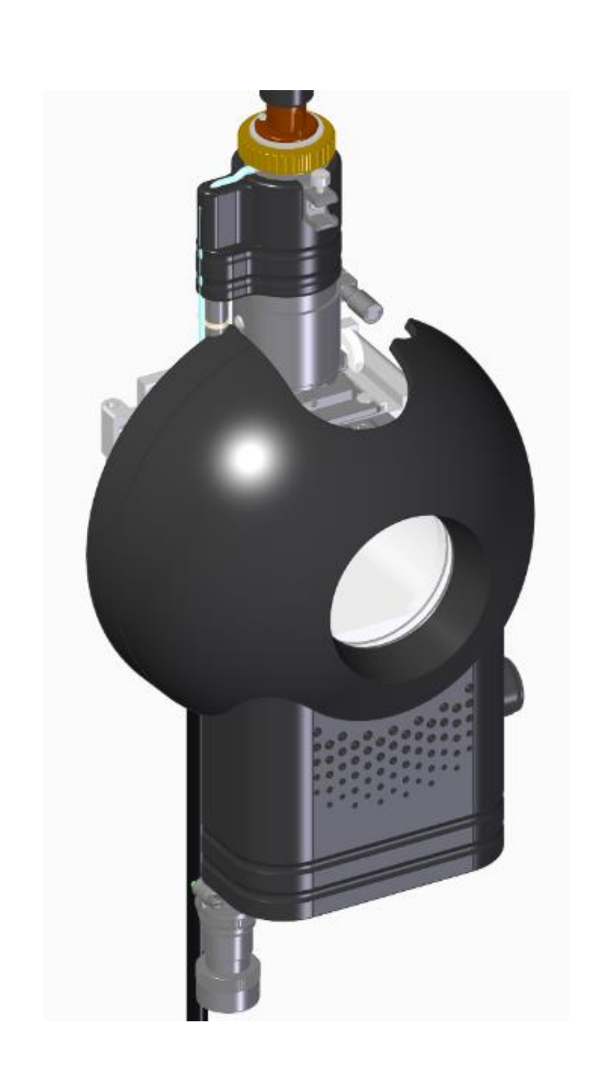
Fig. 1: Technical drawing of the VIP-HESI source

All experiments were compared to data which was acquired with the standard Bruker Apollo II source.