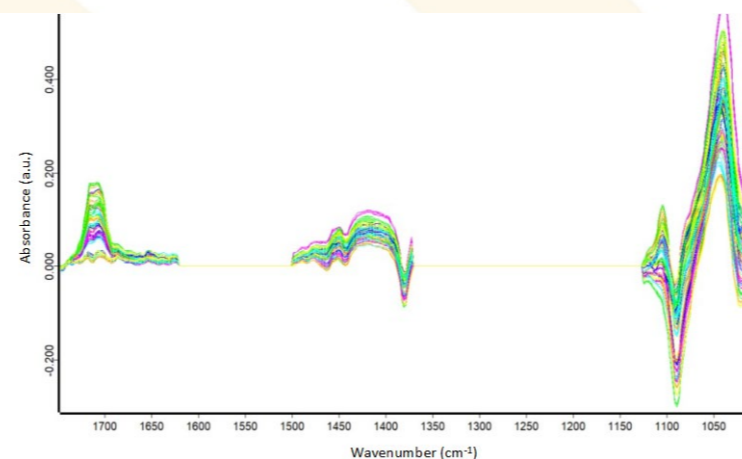
Preprocessed IR spectral data are analysed to determine the progress of the reaction

Autonomously piloted systems require a sensing apparatus for the state estimation. Our goal is to analyze data captured in real-time to distinguish and quantify reaction products directly in-flow. This is essential for reaction monitoring and control. Spectroscopy methods for chemical products detection are attractive because of their relatively low cost and ease of use.