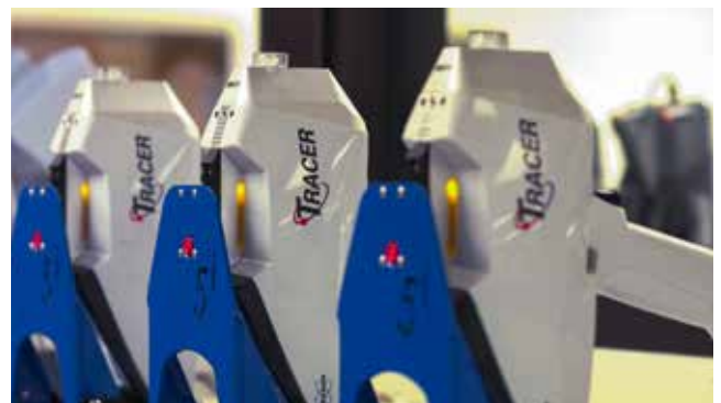
TRACER 5i battery operated handheld XRF spectrometers

Allied BioScience's presentation illustrated the high value of using Bruker's handheld XRF technology as part of their proprietary and patent pending rapid and cost-effective method to enable validation of their invisible antimicrobial polymer coating's activity at any time point.