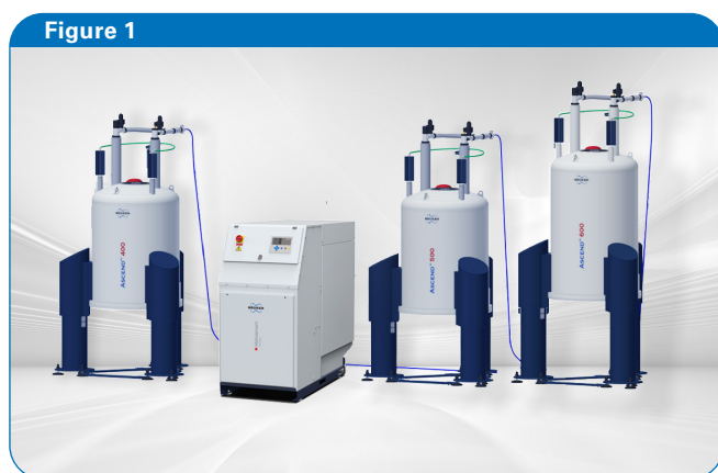
Figure 1: Artist's view of the setup described in the installation example with one recovery unit and three NMR magnets. The high pressure storage is not shown.